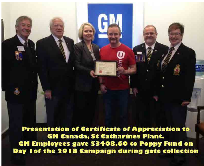
Presentation of Certificate of Appreciation to GM Canada, St Catharines Plant. GM Employees gave $3408.60 to Poppy Fund on Day 1 of the 2018 Campaign during gate collection