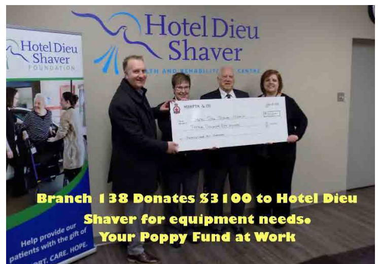
Branch 138 Donates $3100 to Hotel Dieu Shaver for equipment needs. Your Poppy Fund at Work