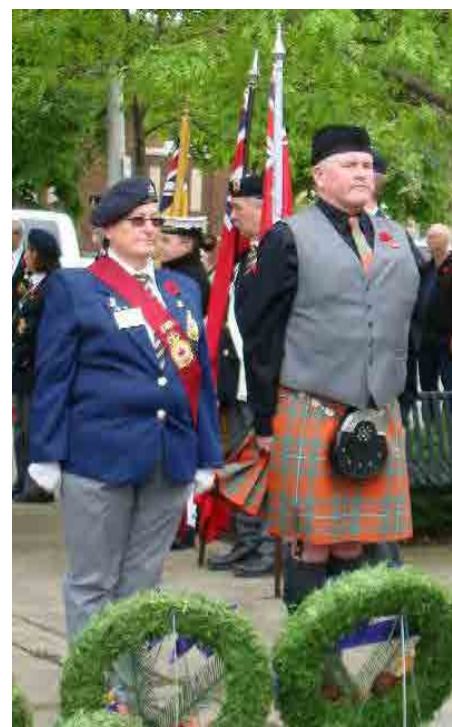
Decoration Day. 2019

Watch for more photos of Branch members in upcoming issues of Legion Magazine. We have had several photos published over the last few months. We have also had photos published in every issue of Snap'd St Catharines as well as some in Niagara This Week.