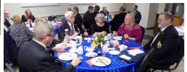
138 th Branch celebrates the 90 th Ann. 2019