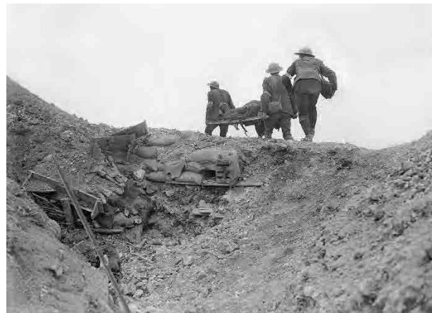
Above: Stretcher bearers during the Battle of Thiepval Ridge, September 1916